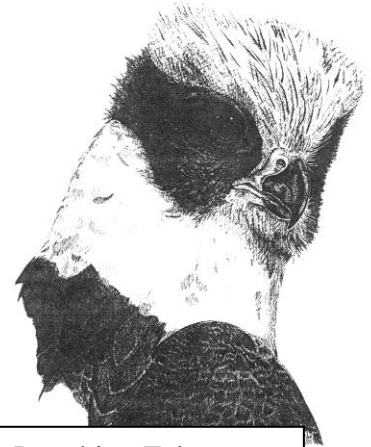
Laughing Falcon by Julio Gallardo

Other migrants enjoyed included White Pelicans, Wood Storks, Scissor-tailed Flycatchers, White-winged Doves, White-faced Ibis, Anhingas, etc.