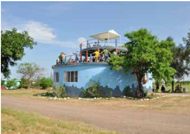
Dr. Mario A. Ramos Bird Observatory.

IMPORTANT: Pronatura do not cover the flight transportation or prior trips to get into Veracruz.