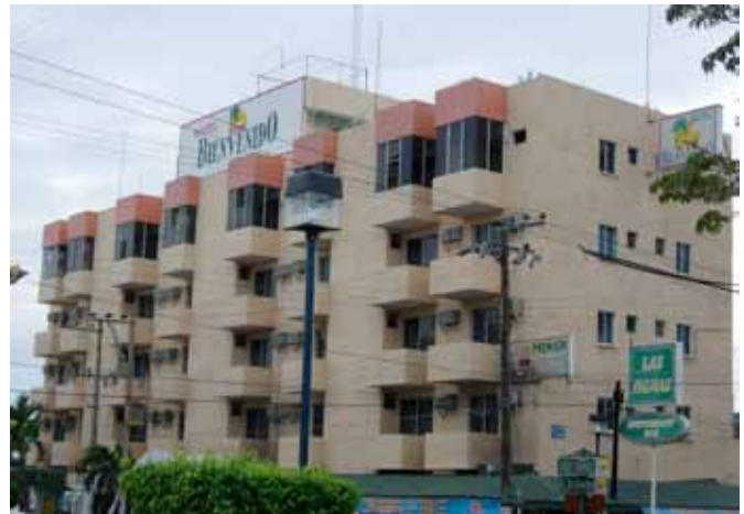
Bienvenido Hotel, Cardel City.